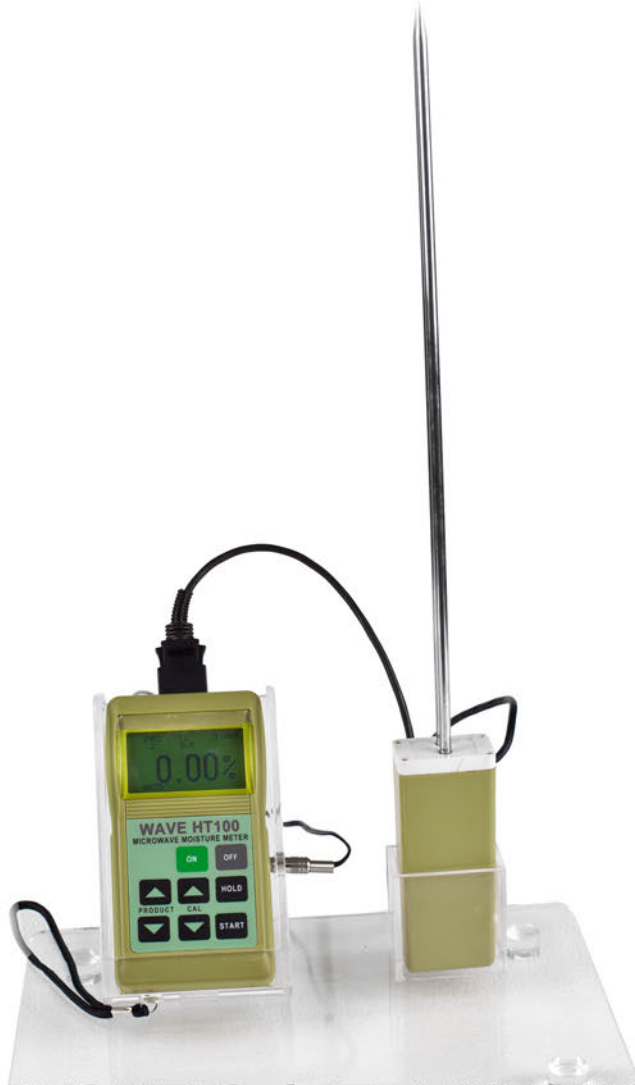
HANDHELD / AT- LINE MICROWAVE TOBACCO MOISTURE METER